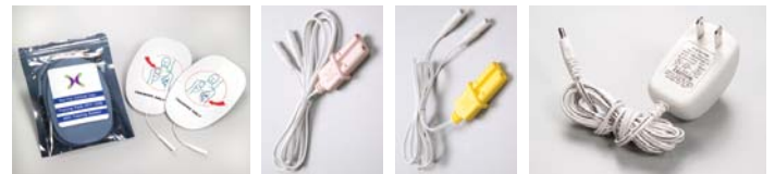
(Replacement items part numbers on page 4)